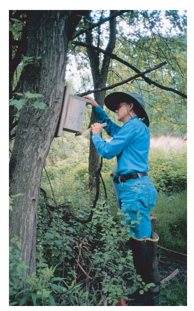
Scientist checking swallow nest box

Results from recent contaminant studies using tree swallows include the following: