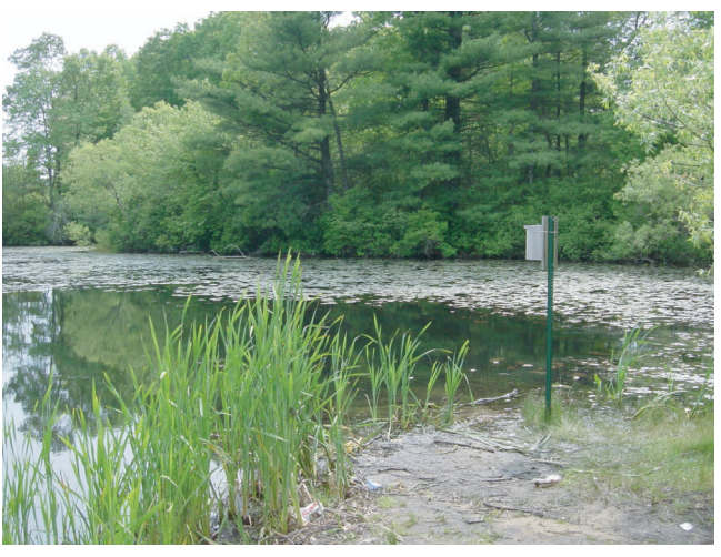
Nest box placed in typical tree swallow habitat

swallows. To do this, we analyze swallow eggs and other tissues for contaminants and compare them to uncontaminated locations. If contaminants are elevated in swallows, the next step is to find out if these contaminants affect tree swallow reproduction or survival. Many environmental contaminants are toxic to bird embryos, so we measure the number of eggs that hatch. We also measure the growth rate and survival of young. Because swallows tend to come back to where they nested the previous year, we can band them at their nest box and recapture adults in subsequent years. The percent of adult swallows that return the following year can be compared between contaminated and clean sites.