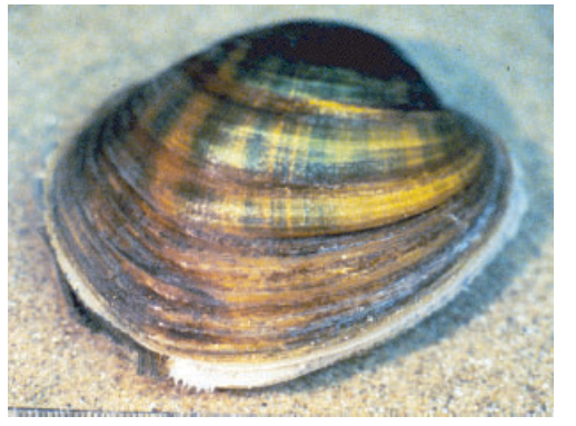
The Higgins eye ( Lampsilis higginsi ) is one of several freshwater mussel species in the Upper Mississippi River Basin on the Federal endangered species list.

Although many threats may be contributing to the declines in species density and diversity, past efforts have not determined which threats are most important. Because freshwater mussels are declining nationwide, it is important to understand what contributes to their distribution (location) and abundance (numbers) across large geographic areas. Much of the research on mussels has been conducted on small streams by teams of mussel specialists measuring traditional habitat variables. Most attempts to predict the distribution or abundance of mussels from variables such as substrate type or water depth have failed when tested critically, suggesting that these measures are inadequate descriptors of mussel communities. Also, many freshwater mussels require a fish host to complete their life cycle. Therefore, management approaches need to maintain the connection between mussels and their host fish. Further advances in understanding mussel populations will probably require a multidisciplinary approach that includes biology, chemistry, and hydrology in both large and small geographic areas.