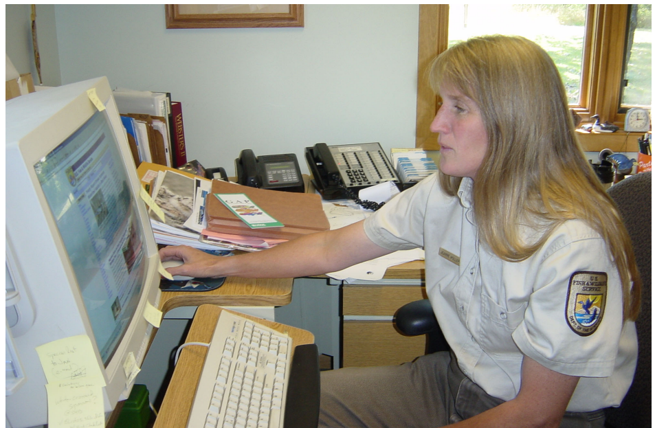
Management agencies such as the U.S. Fish and Wildlife Service use decision support system tools to set priorities for management.

USGS Upper Midwest Environmental Sciences Center 2630 Fanta Reed Road La Crosse, WI 54603 http://www.umesc.usgs.gov/