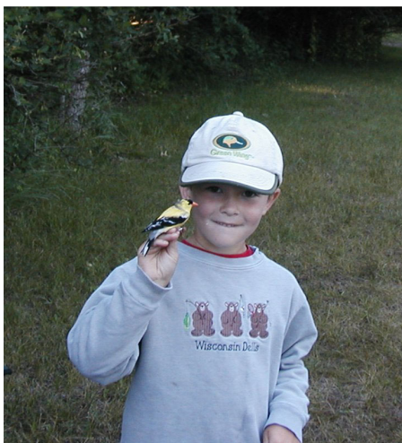
Decision support tools help managers protect bird populations for the enjoyment of future generations.

Conservation planning is a high priority for many Federal agencies. The U.S. Fish and Wildlife Service (FWS) is currently developing Comprehensive Conservation Plans (CCP) for all National Wildlife Refuges, the National Park Service is developing Inventory and Monitoring Networks for all Parks, and the National Forest Service continually revises forest management plans. These agencies are charged with providing for wildlife and habitat concerns and need ways to incorporate landscape, species, and habitat relations into their conservation planning. Computerized decision support systems (DSS) provide a means for organizing existing geographical, physical, and biological data for better management of natural resources.